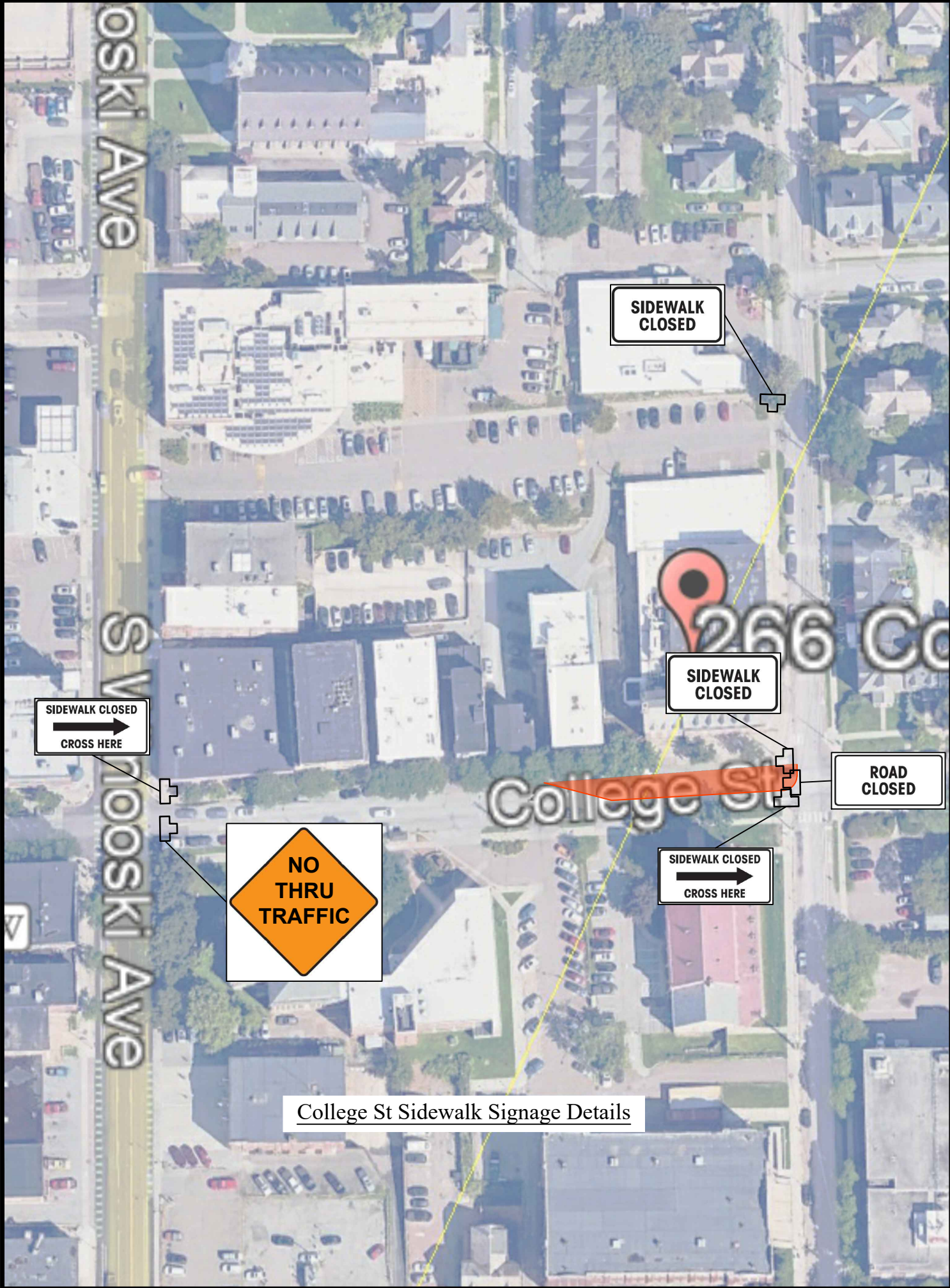
College St Sidewalk Signage Details